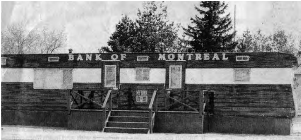
The first Bank of Montreal in Northbrook opened on May 17, 1965 in a trailer. Frontenac News , May 14, 2015. A second portable, below left, replaced the trailer in the 1970s. Mary Lloyd Johnson Album – photo date 1988 . During the transition the bank was located in the building next door, below right. The date on the photo is 1970. Photo is in BMO.

The trailer was replaced with a second portable building in the 1970s. The original trailer was moved to a mining operation up north. It must have been during this transition that the bank was temporarily located in the building next door, now the North of 7 Codfather Restaurant.