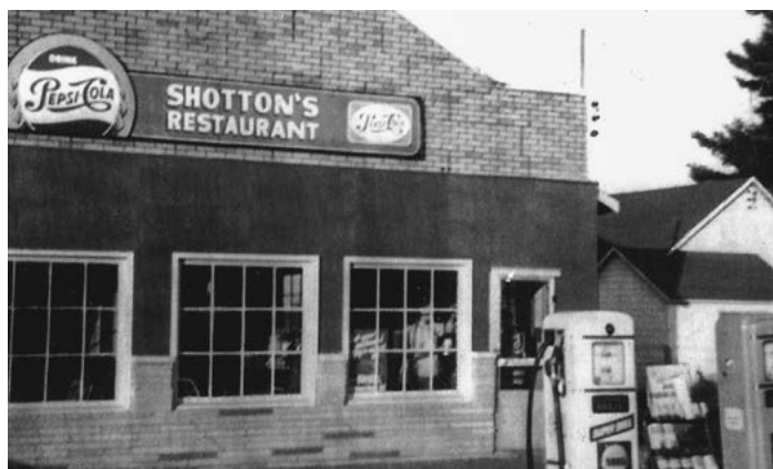
Ed and Ada Shotton built a motel (now the Pine Grove Motel) with Shotton's Restaurant in front. The restaurant burned down in the 1960s.