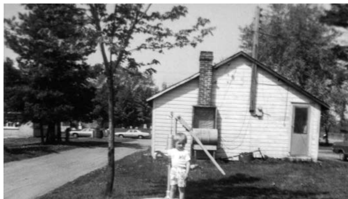
This telephone office building was situated approximately where the current Liquor Store is. The photo is taken from the back of the building looking towards the Hwy.