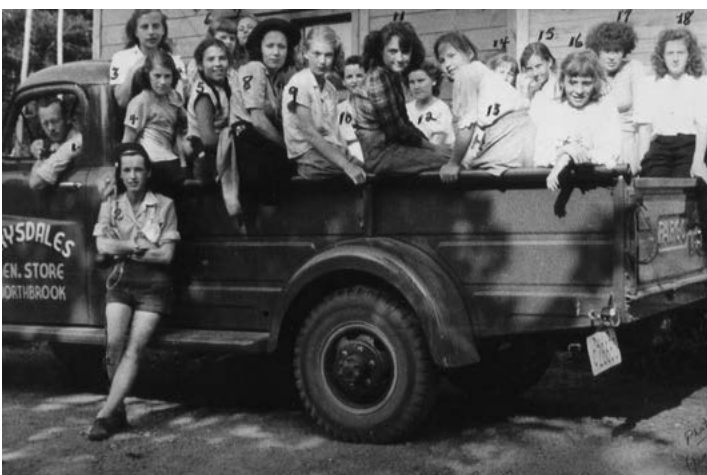
mom. The CDHS would like to encourage members and friends to contribute photos for scanning to add to our digital collection. We also welcome articles for submission to the Pioneer Times.