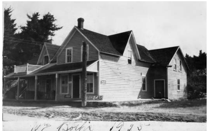
Both Store, 1925. The building burned down in 1987. A Real Estate office now occupies the site.