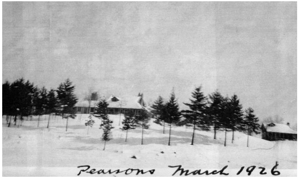
Pearson cottage (later Skootamatta Lodge) on the left, Moore cottage on the right, 1926.